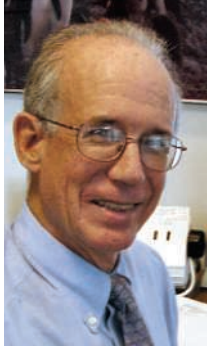
Donald Kennedy is Editor-in-Chief of Science .